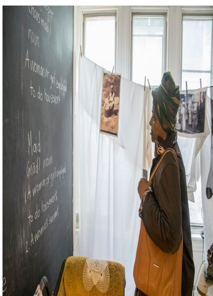
The Colored Girls Museum Virtual Tour-One Room School House & Washer Woman Exhibits